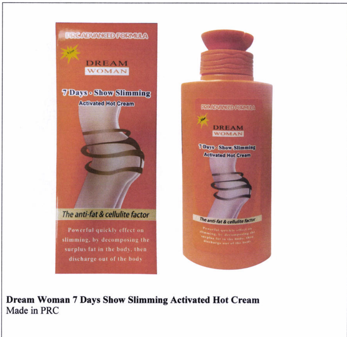
Dream Woman 7 Days Show Slimming Activated Hot Cream Made in PRC

The Food and Drug Administration (FDA) advises the public against the purchase and use of the following unregistered drug products: