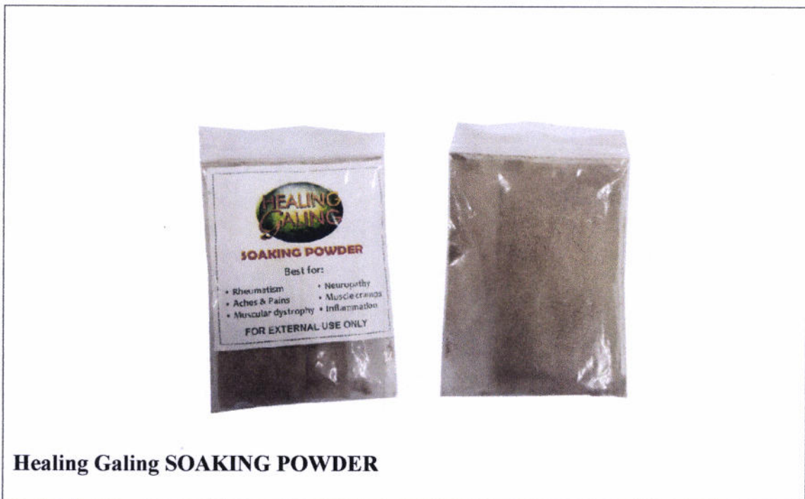
Healing Galing SOAKING POWDER

The Food and Drug Administration (FDA) advises the public against the purchase and use of the unregistered drug product: